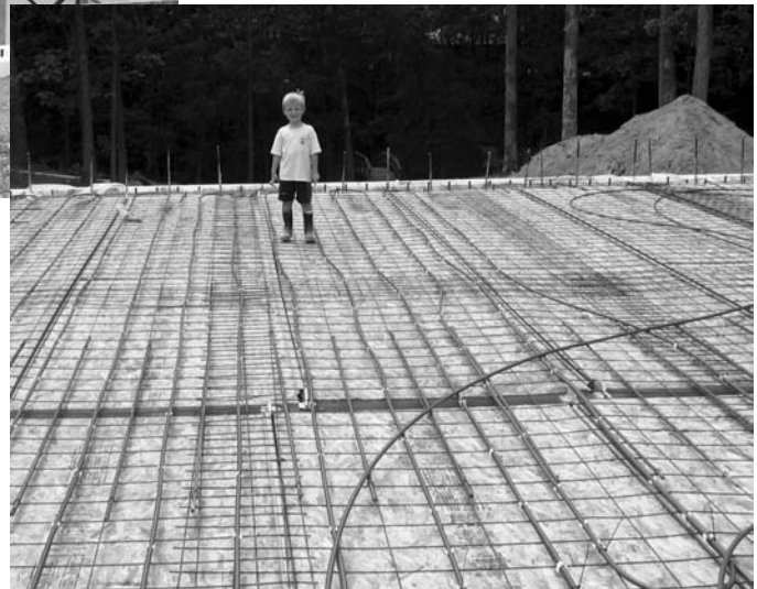
Below: Reid Doll stands on the plywood that will be removed after the suspended Speedfloor system concrete floor is placed and set.