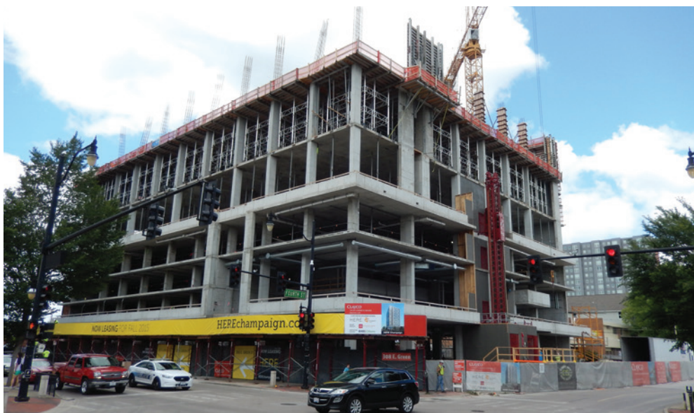
10,000 PSI concrete supplied by Blager Concrete Company

A 16-story high rise apartment building in Campustown at the University of Illinois is set to open the fall of 2015. The state of the art LEED facility will feature an automated parking system where cars will be moved by elevators to “parking vaults” on the second, third and fourth floors.